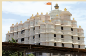
Shree Siddhivinayak Ganapati Mandir