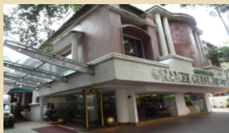
Ramee Guest Hotel Plot No.3, Kohinoor Road, Opp. Swami Narayan Temple, Dadar, Mumbai-400014, India

Contact No. :- 91 22692 / 47900 E- mail: - reservations.dadar@rameehotels.com