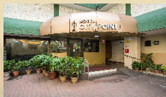
Hotel City Point Khodadad Circle, behind Imperial Mahal, Dadar East, Mumbai, Maharashtra 400014 Contact No. :- 9820926275/920999975 E- mail :- info@hotelcitypoint.com Web site :- www.hotelcitypoint.com

Contact No. :- 91 22692 / 47900 E- mail: - reservations.dadar@rameehotels.com