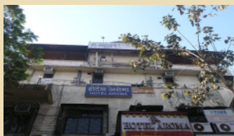
Hotel Aroma- Dadar Mumbai 190, Satnam Mansion, Dr Ambedkar Road, Near Chitra Cinema, Dadar (East), Mumbai, India. Contact no. :- 022-24111761.