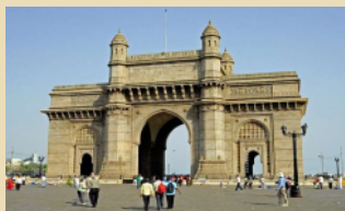
Gateway of India