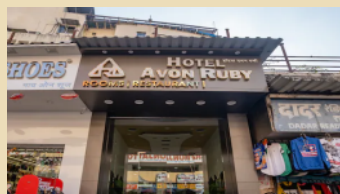
Hotel Avon Ruby Mumbai 87, Naigaon Cross Road, Near Dadar Railway Station, Dadar (E), Mumbai, Maharashtra, India Contact No. :- 22-42133600 E - mail bookings@hotelavonruby.net